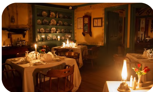
Ye Olde Tavern