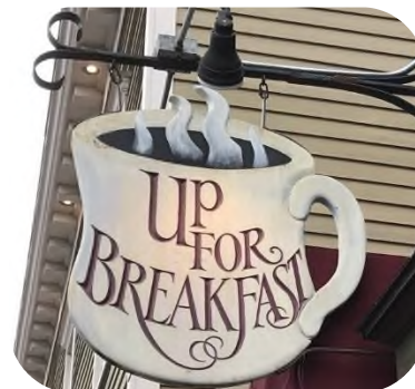
Up for Breakfast