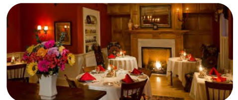
The Dorset Inn

GPS address: 8 Church Street, Dorset, VT 05251 Phone: (802) 867-5500